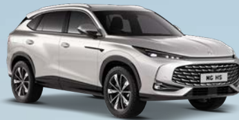
CHAMPAGNE SILVER METALLIC PAINT*