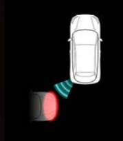
Active Rear Cross Traffic Alert