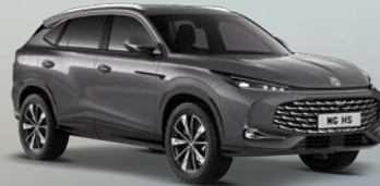
CHARCOAL GREY METALLIC PAINT*