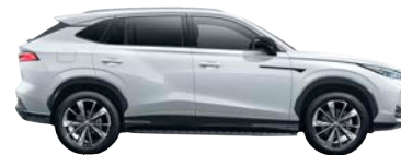
Wheelbase 2765mm Length 4670mm (Plug-in Hybrid)

Height - including roof rails 1664mm (Petrol) 1663mm (Plug-in Hybrid)