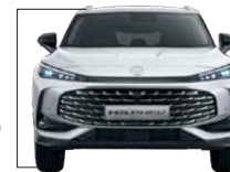
Front track 1590mm. Rear track 1584

Height - including roof rails 1664mm (Petrol) 1663mm (Plug-in Hybrid)