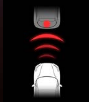
Active Emergency Braking (AEB)