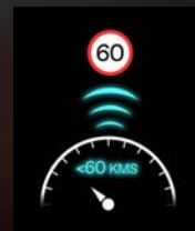
Intelligent Speed Limit Assist