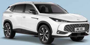
WHITE PEARL STANDARD PAINT

With a choice of five colours to choose from, you can make your MG HS PHEV a powerful expression of your personality.