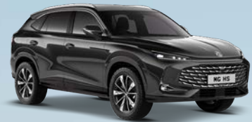
BLACK PEARL METALLIC PAINT*