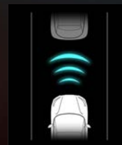
Intelligent Cruise Assist

For more information, please visit your local MG dealer.