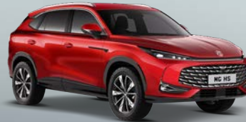
DYNAMIC RED TRI-COAT PAINT*

*Tri-coat and metallic paint optional at extra cost. Two tone door mirrors on all exterior colours except White Pearl and Black Pearl, which come with one tone black door mirrors. Images for illustration purposes.