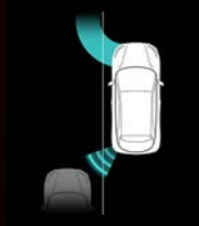
Lane Change Assist