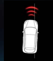
Lane Departure Warning System