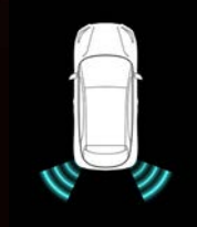
Blind Spot Detection